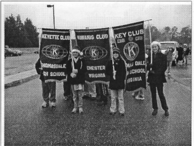
Our Key and Keyettes on Parade

Parade will finish at fire station (not the YMCA) in front of old Lowe's Store Bldg (across from Heritage Chevrolet.